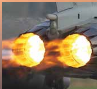
Titanium withstands the high temperatures in military jet engine afterburners. 1

Menu-driven software makes setup and operation a snap.